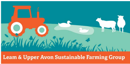
Leam & Upper Avon Sustainable Farming Group