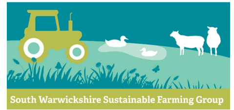
South Warwickshire Sustainable Farming Group