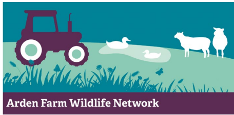
Arden Farm Wildlife Network