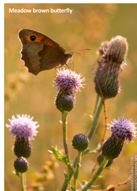
Meadow brown butterfly