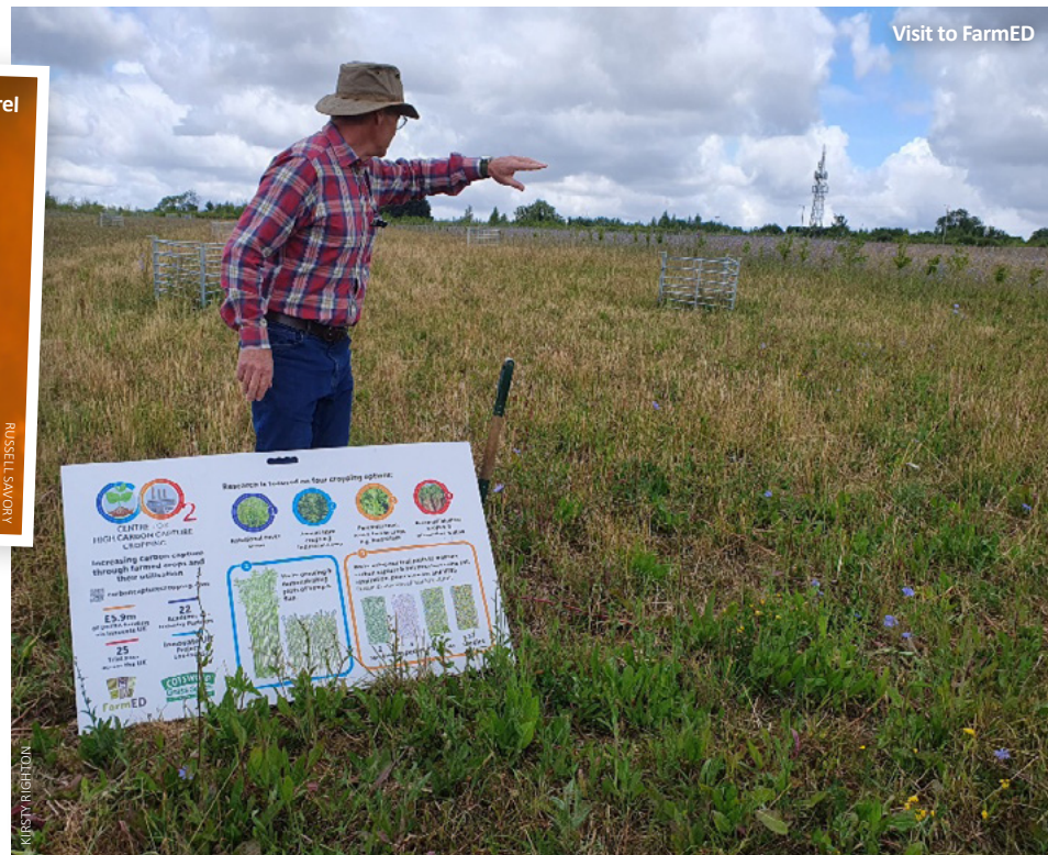
Visit to FarmED